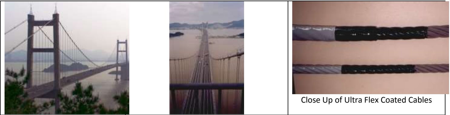
Close Up of Ultra Flex Coated Cables